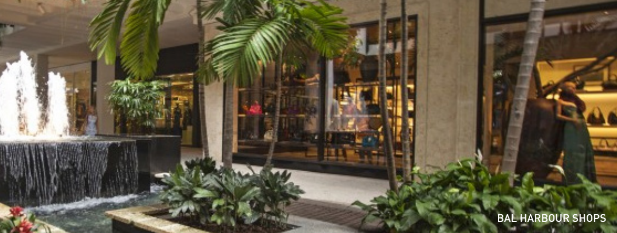
BAL HARBOUR SHOPS