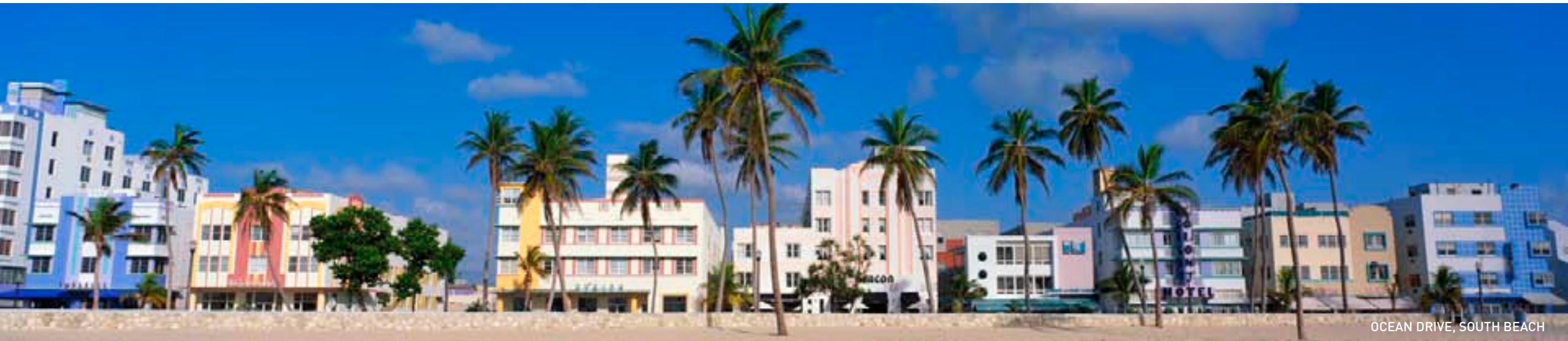
OCEAN DRIVE, SOUTH BEACH